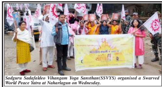
Sadguru Sadafaldeo Vihangam Yoga Sansthan(SSVYS) organised a Swarwad World Peace Yatra at Naharlagun on Wednesday.

lage. Seeing the grim situation, the village authority has requested the job holders, PRIs members of the village to contribute as per their means to save their own village from further erosion. He informed that due to continued collection of natural resources from the river such a situation had arisen. Every year the quarry owners used hundreds of JCBs, trucks to extract stones, sand and sand gravels from the river.